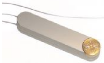
Flat power supply with integrated dimmer