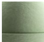
green RAL 6021