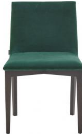
CHAIR BASE IN NATURAL BEECH