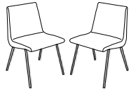
set of 2 chairs base in natural ash

H 830 - mm W 480 - mm D 570 - mm SH 480 - mm