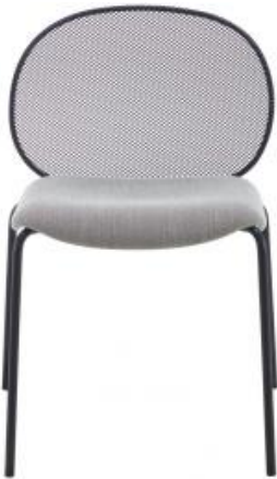
CHAIR INDOOR WHITE LACQUERED BASE

H 810 mm - W 580 mm - D 560 mm - SH 480 mm -