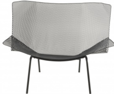
ARMCHAIR BLACK INDOOR / OUTDOOR

Base in tubular steel, supplied with plastic tips for insertion on delivery. Grillage has been treated against corrosion with a cataphoresis treatment, anti-rust lacquer and a final layer of anti-UV polyester lacquer. This treatment makes Grillage just as suitable for outdoor use as it is to be used indoors.