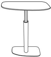
table white lacquered base top in white fenix laminate

DIMENSIONS H 755 - mm W 680 - mm L 900 - mm