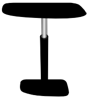
table black lacquered base top in black fenix laminate

DIMENSIONS H 755 - mm W 680 - mm L 900 - mm