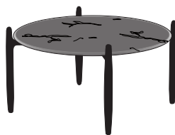
low table verde