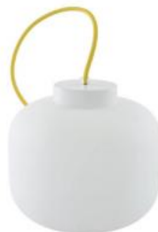
TABLE LAMP WHITE OPAL GLASS