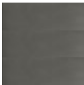
OP0 transparent varnished