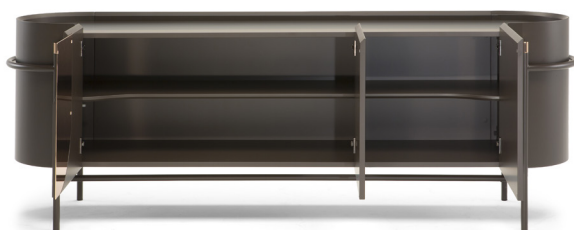
■ W02201X Details