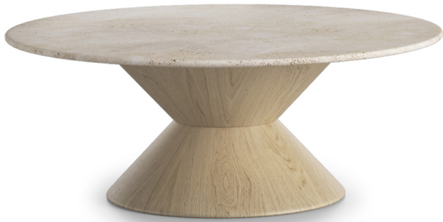
■ T876001XNA (draft image)