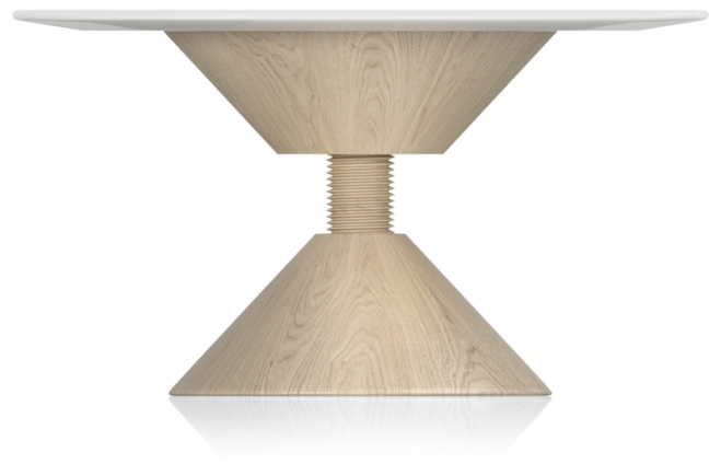
■ T876002XNA (draft image)