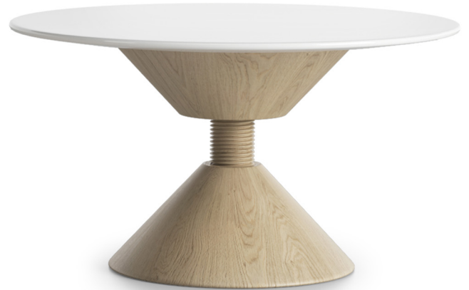
■ T876002XNA (draft image)