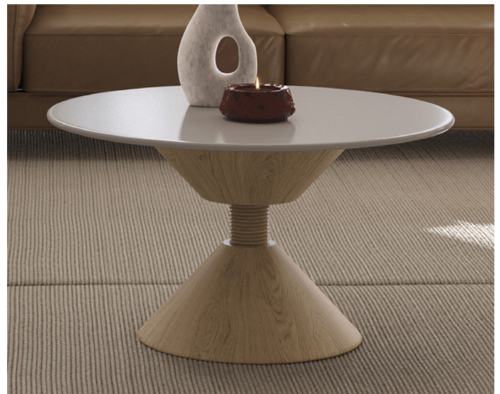
■ T876002XNA (draft image)