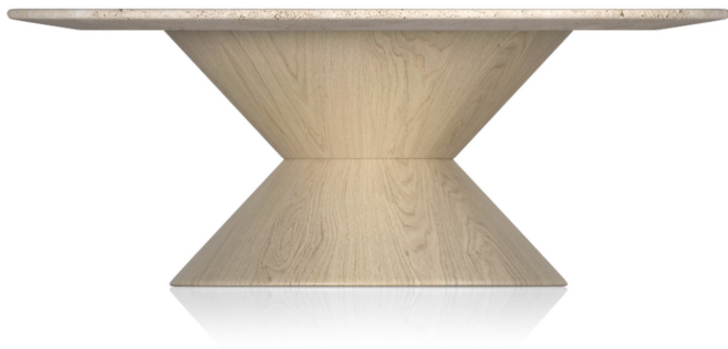
■ T876001XNA (draft image)