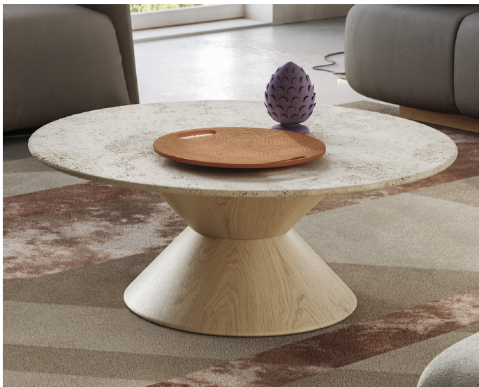
■ T876001XNA (draft image)