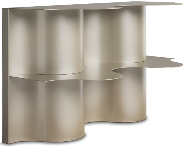
■ H844002XNA (100 x 46 x H61 cm)