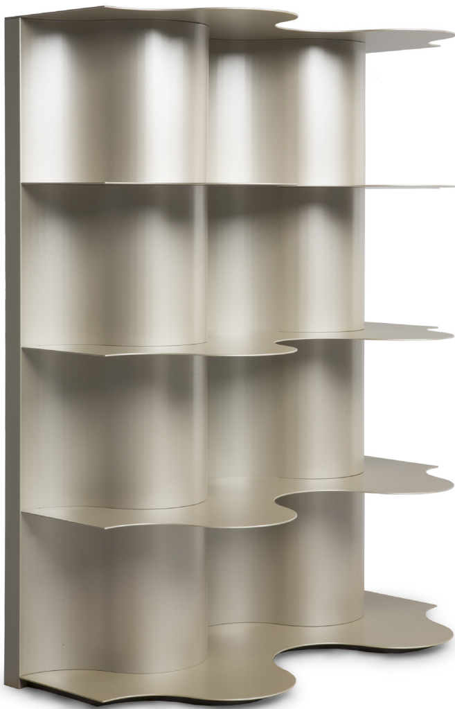
■ H844001XNA (100 x 46 x H124 cm)