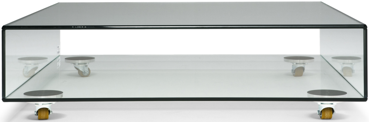
■ T879001XNA transparent glass 90x90cm