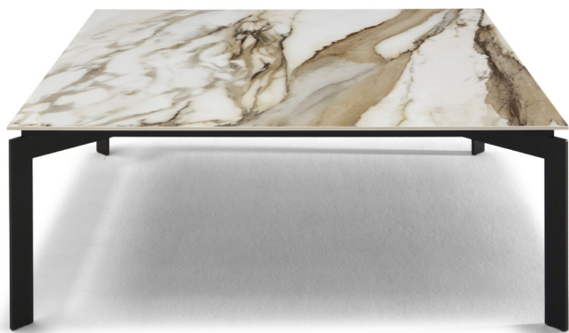
■ T042016XOF / T042016XDD