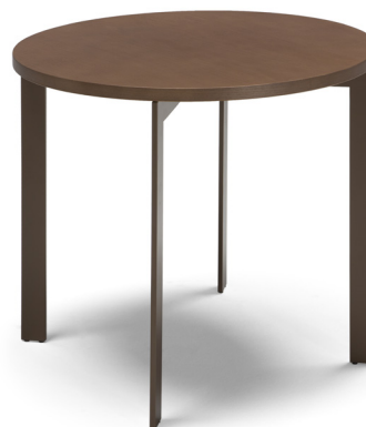
■ T042005XOF / T042005XDD