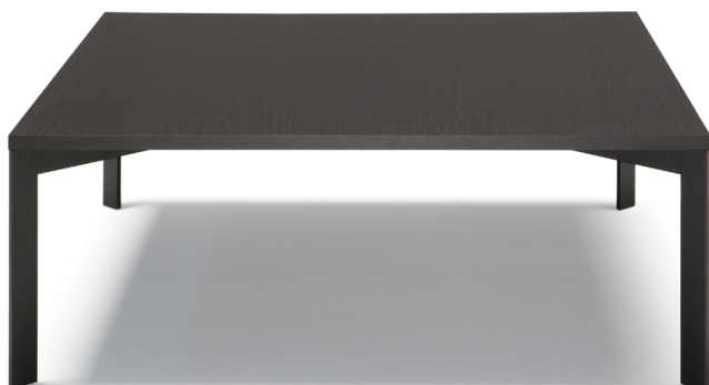
■ T042001XOF / T042001XDD