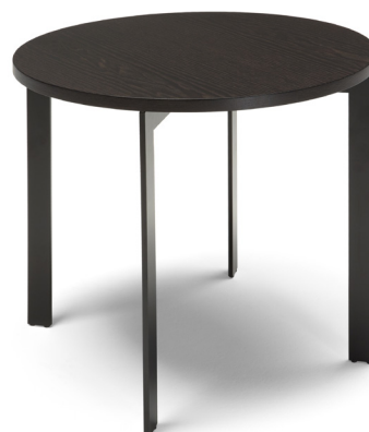
■ T042004XOF / T042004XDD

ALL PICTURES SHOWN ARE FOR ILLUSTRATIVE PURPOSE ONLY. ACTUAL PRODUCT MAY VARY DUE TO PRODUCT ENHANCEMENT.