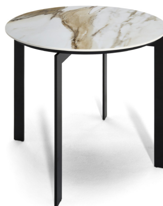
■ T042017XOF / T042017XDD