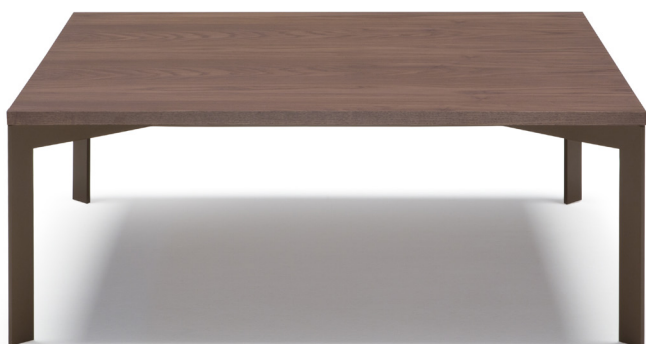
■ T042002XOF / T042002XDD