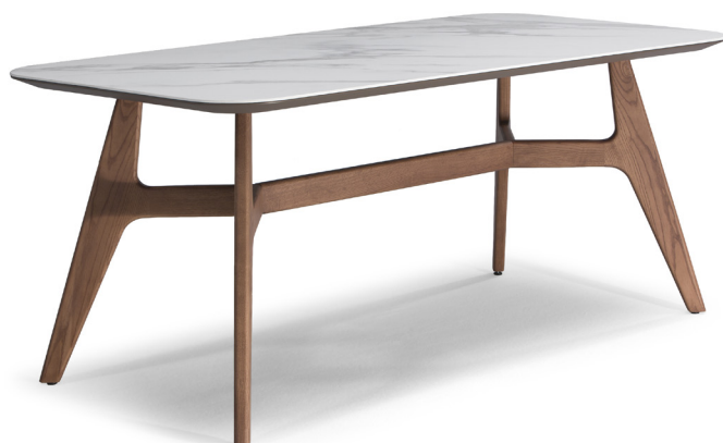
■ T22209X / T22215X