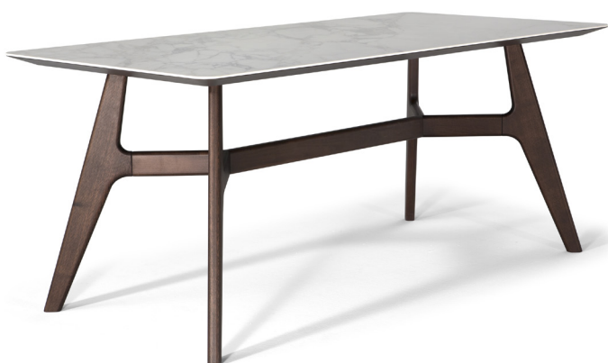
■ T22208X / T22214X