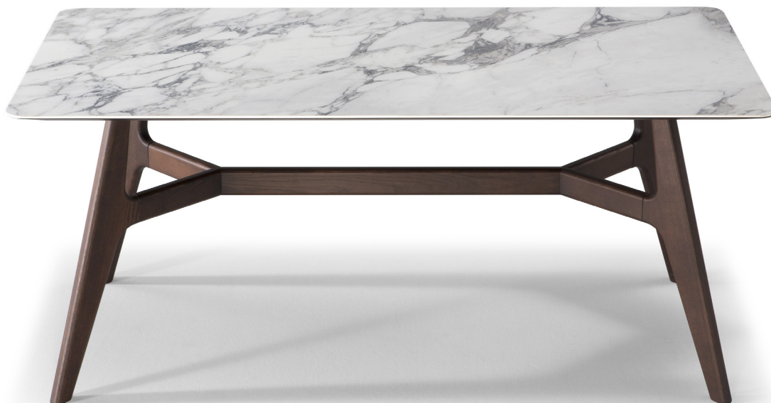
■ T22208X / T22214X

ALL PICTURES SHOWN ARE FOR ILLUSTRATIVE PURPOSE ONLY. ACTUAL PRODUCT MAY VARY DUE TO PRODUCT ENHANCEMENT.