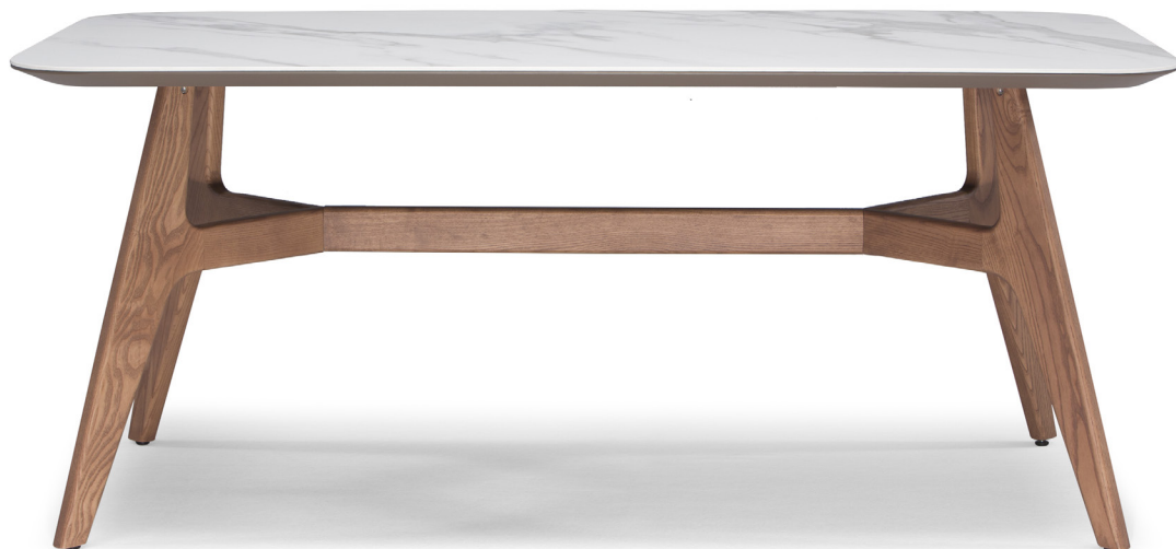
■ T22209X / T22215X