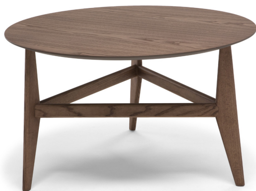
■ E22235X / E22259X