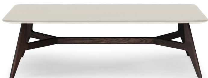
■ E22228X / E22252X