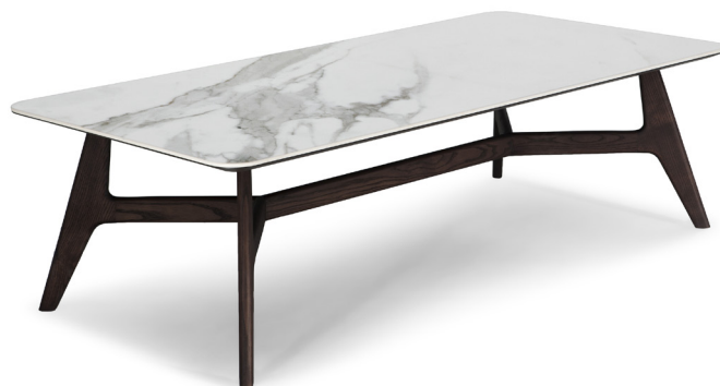
■ E22227X / E22251X