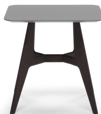
■ E22232X / E22256X

ALL PICTURES SHOWN ARE FOR ILLUSTRATIVE PURPOSE ONLY. ACTUAL PRODUCT MAY VARY DUE TO PRODUCT ENHANCEMENT.