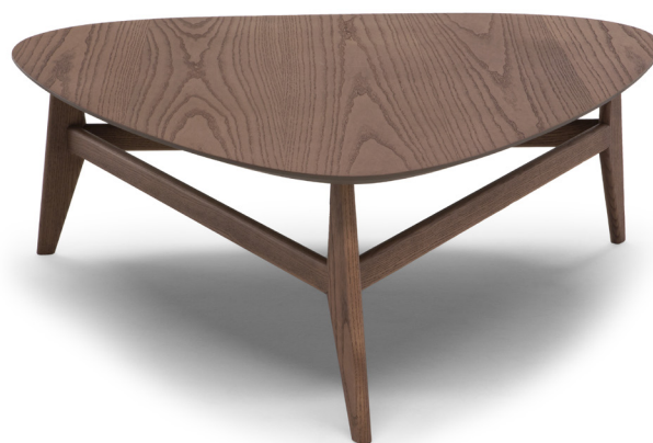
■ E22234X / E22258X