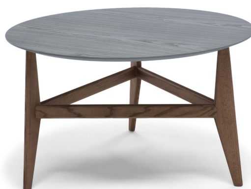
■ E22236X / E22260X