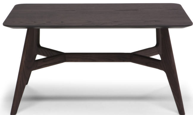
■ E22230X / E22254X