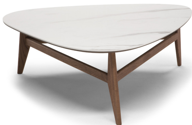
■ E22233X / E22257X