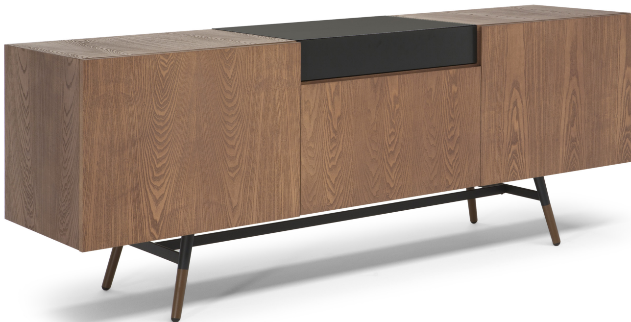
■ W22602X / W22604X