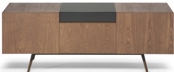
■ W22602X / W22604X