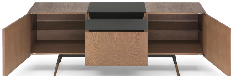
■ W22602X / W22604X