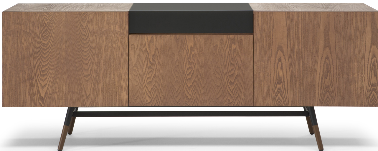
■ W22602X / W22604X

ALL PICTURES SHOWN ARE FOR ILLUSTRATIVE PURPOSE ONLY. ACTUAL PRODUCT MAY VARY DUE TO PRODUCT ENHANCEMENT.