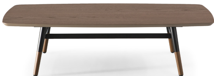
■ E22604X / E22608X