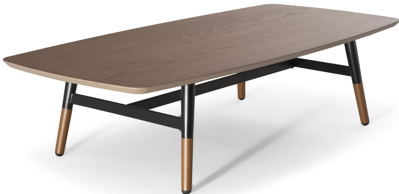
■ E22604X / E22608X