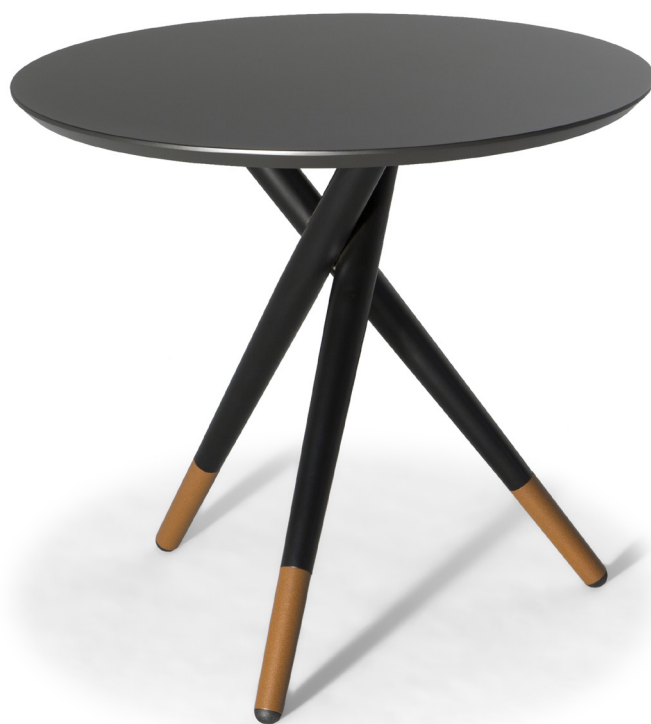
■ E22603X / E22607X