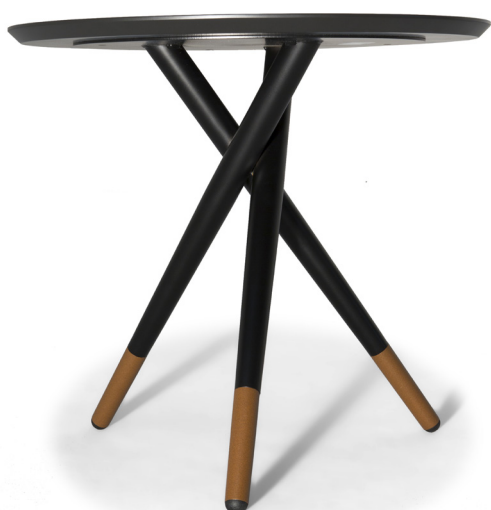
■ E22603X / E22607X