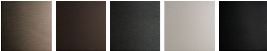
11 satin titanium