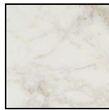
GLOSSY CALACATTA GOLD