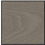
Ash wood tobacco