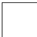
Gold & Glass