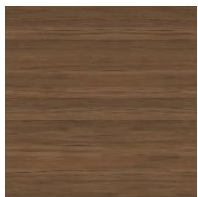
Шпонированное дерево Черный орех