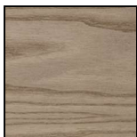
Ash Wood/Tobacco/Ch ampagne