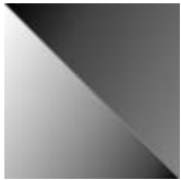
matt black aluminium