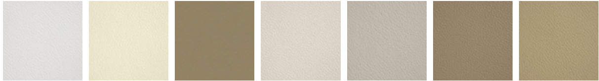
971 BIANCO 961 LATTE 967 AVORIO 947 OYSTER 948 LINO 950 TORTORA 945 SAFARI