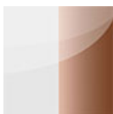
white - bronze