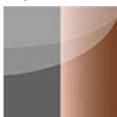
grey - bronze