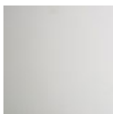
OP71 matt white