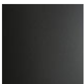
OP69 matt graphite