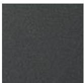
GF69 embossed graphite