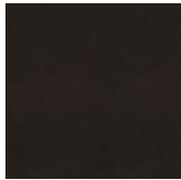
GFM18 bronze embossed