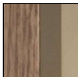
Glossy Champagne/Ash Wood Tobacco