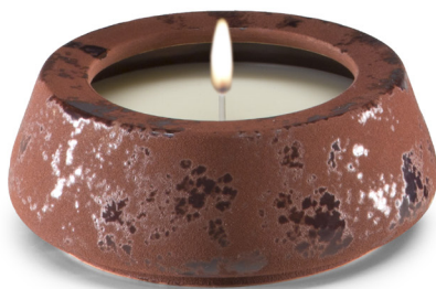
■ A22201X detail