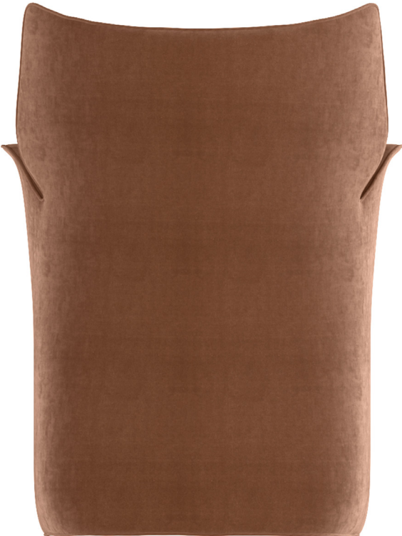
■ CH240039K00 (draft image)

ALL PICTURES SHOWN ARE FOR ILLUSTRATIVE PURPOSE ONLY. ACTUAL PRODUCT MAY VARY DUE TO PRODUCT ENHANCEMENT.