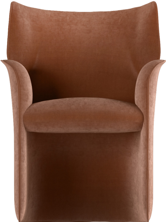
■ CH240039K00 (draft image)