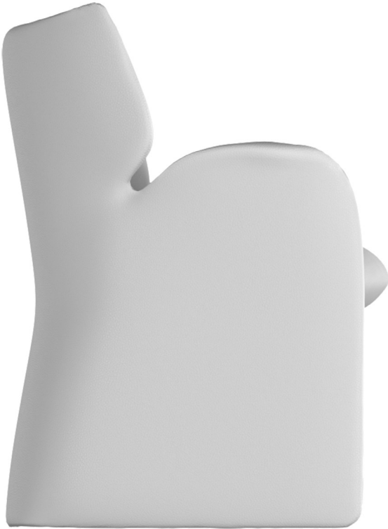
■ CH240033000 (draft image)