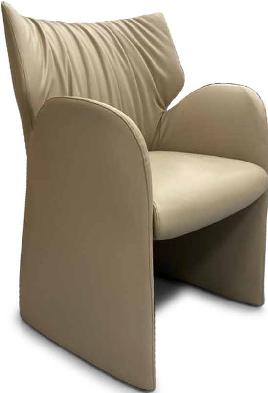
■ CH240032400 (draft image)