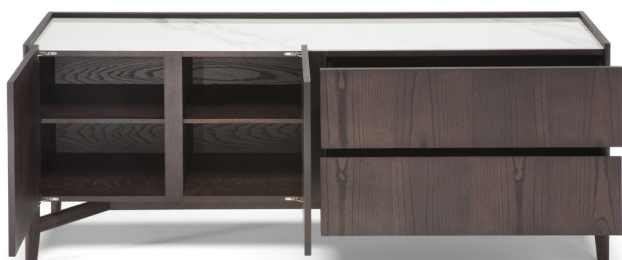
■ W22204X / W22207X