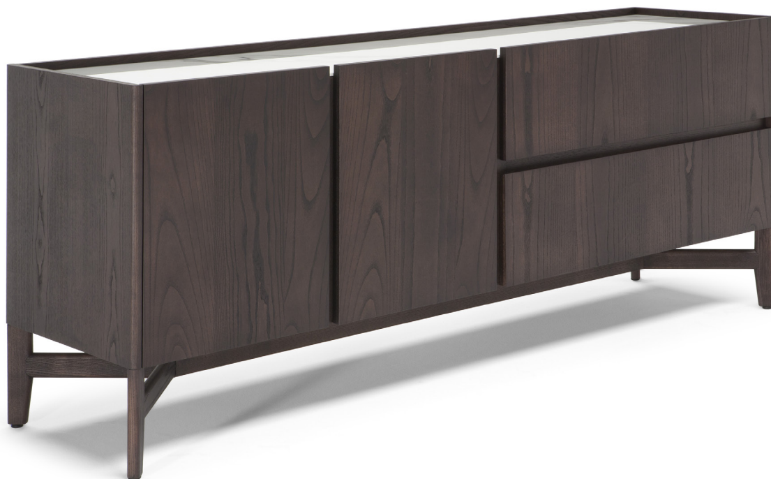
■ W22204X / W22207X