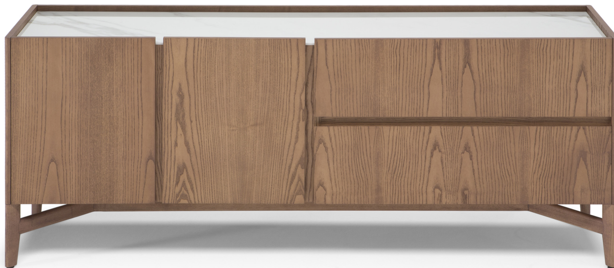
■ W22203X / W22206X

ALL PICTURES SHOWN ARE FOR ILLUSTRATIVE PURPOSE ONLY. ACTUAL PRODUCT MAY VARY DUE TO PRODUCT ENHANCEMENT.