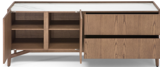
■ W22203X / W22206X