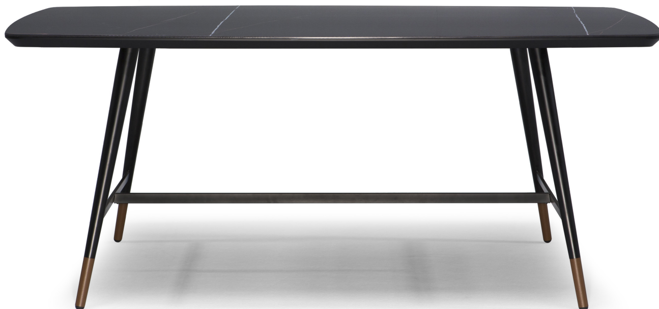
■ T22605X / T22611X