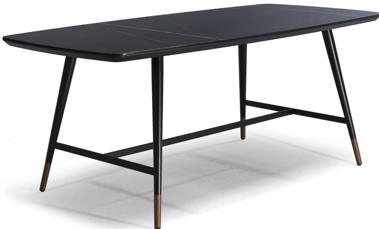
■ T22605X / T22611X