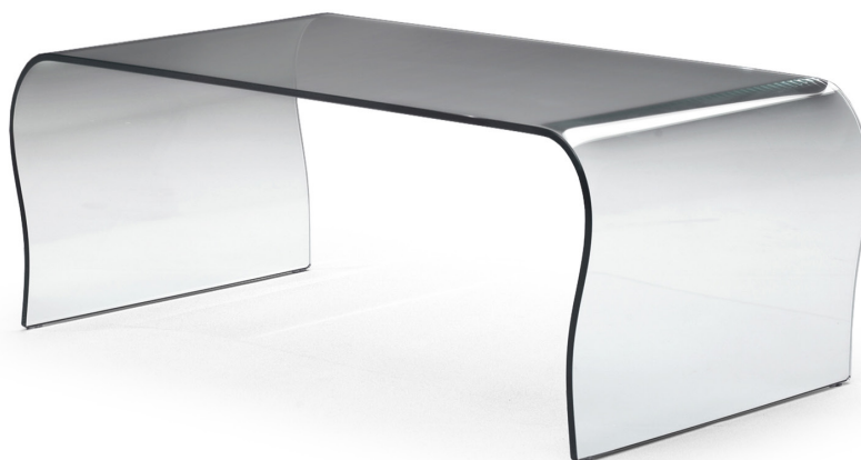
■ T18202X • 120 x 62 x H42 cm / 47x 24 x H17 in