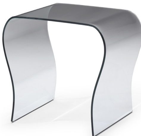
■ T18201X • 60 x 50 x H56 cm / 24 x 20 x H22 in

ALL PICTURES SHOWN ARE FOR ILLUSTRATIVE PURPOSE ONLY. ACTUAL PRODUCT MAY VARY DUE TO PRODUCT ENHANCEMENT.