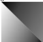
painted dark grey