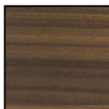
EUCALIPTUS - GLOSSY BRICK