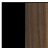
GLOSSY BLACK CHROME - EUCALIPTO WOOD