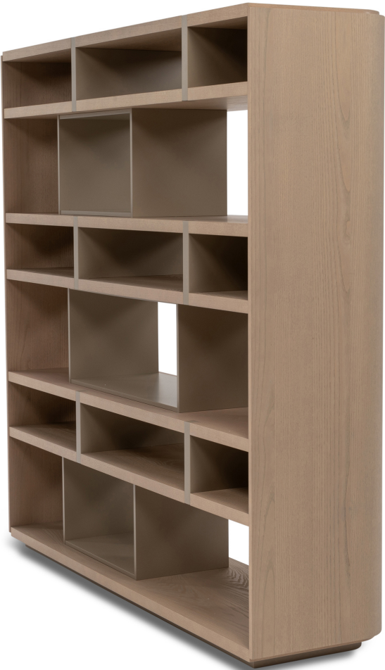
■ Bookcase: H186001XOF-DD

ALL PICTURES SHOWN ARE FOR ILLUSTRATIVE PURPOSE ONLY. ACTUAL PRODUCT MAY VARY DUE TO PRODUCT ENHANCEMENT.