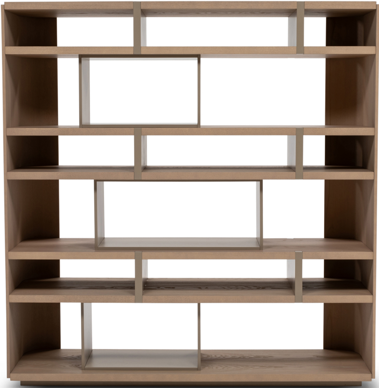
■ Bookcase: H186001XOF-DD