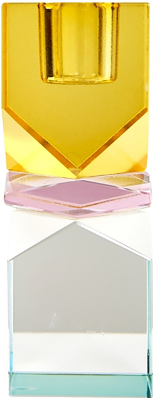
■ O180002XOF / O180002XDD