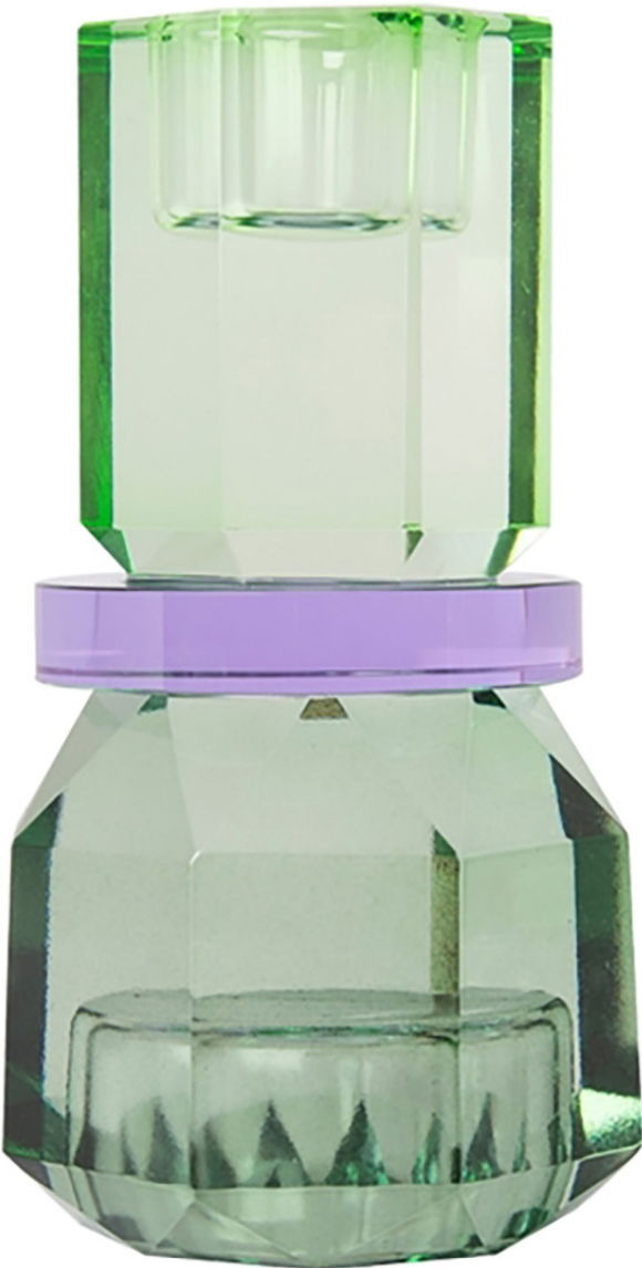
■ O174003XOF / O174003XDD