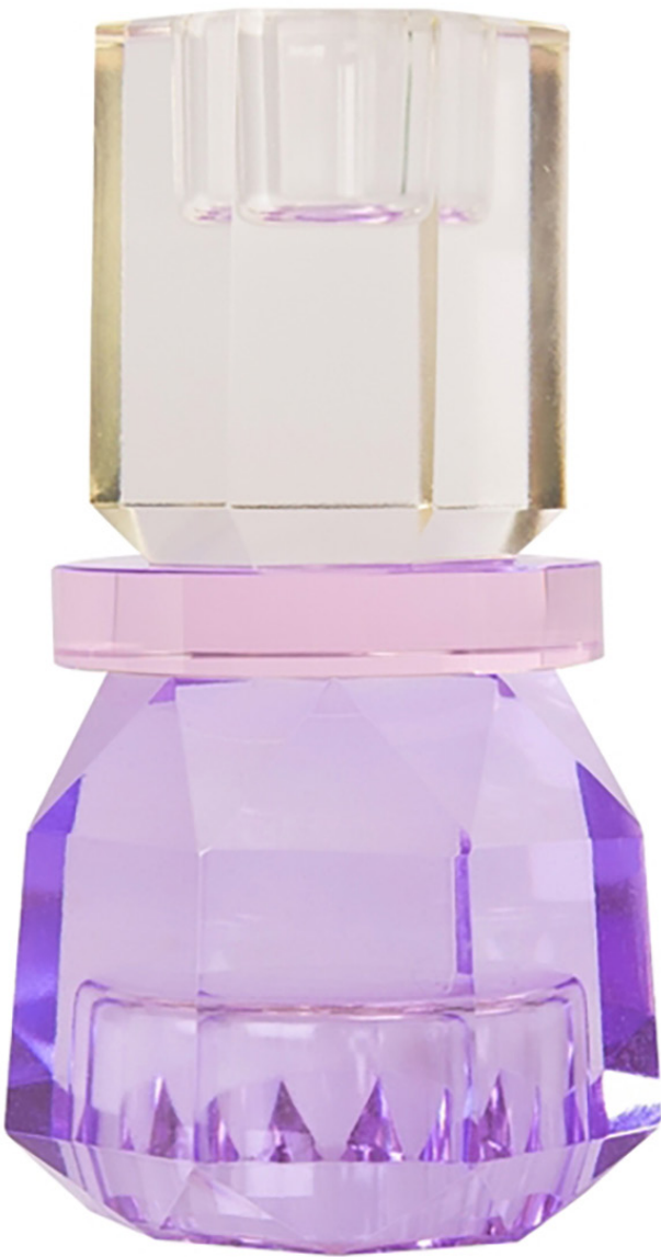
■ O174004XOF / O174004XDD

ALL PICTURES SHOWN ARE FOR ILLUSTRATIVE PURPOSE ONLY. ACTUAL PRODUCT MAY VARY DUE TO PRODUCT ENHANCEMENT.