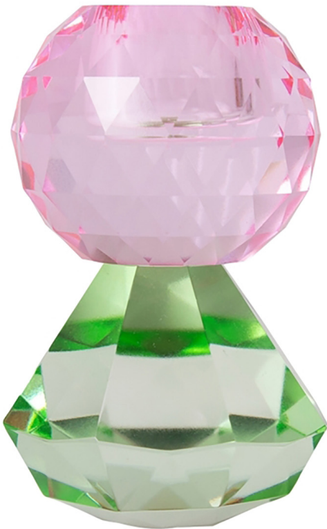
■ O173002XOF / O173002XDD