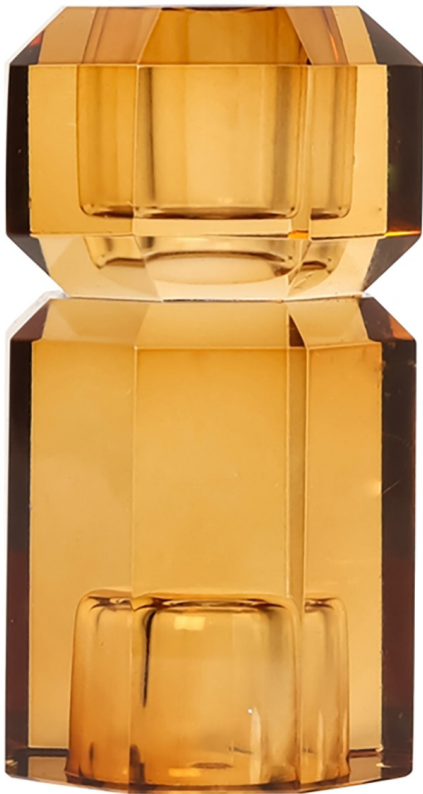
■ O181004XOF / O181004XDD