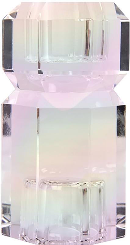
■ O181003XOF / O181003XDD