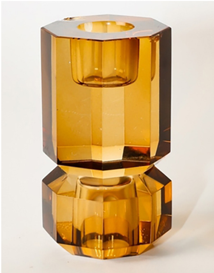
■ O181004XOF / O181004XDD

ALL PICTURES SHOWN ARE FOR ILLUSTRATIVE PURPOSE ONLY. ACTUAL PRODUCT MAY VARY DUE TO PRODUCT ENHANCEMENT.