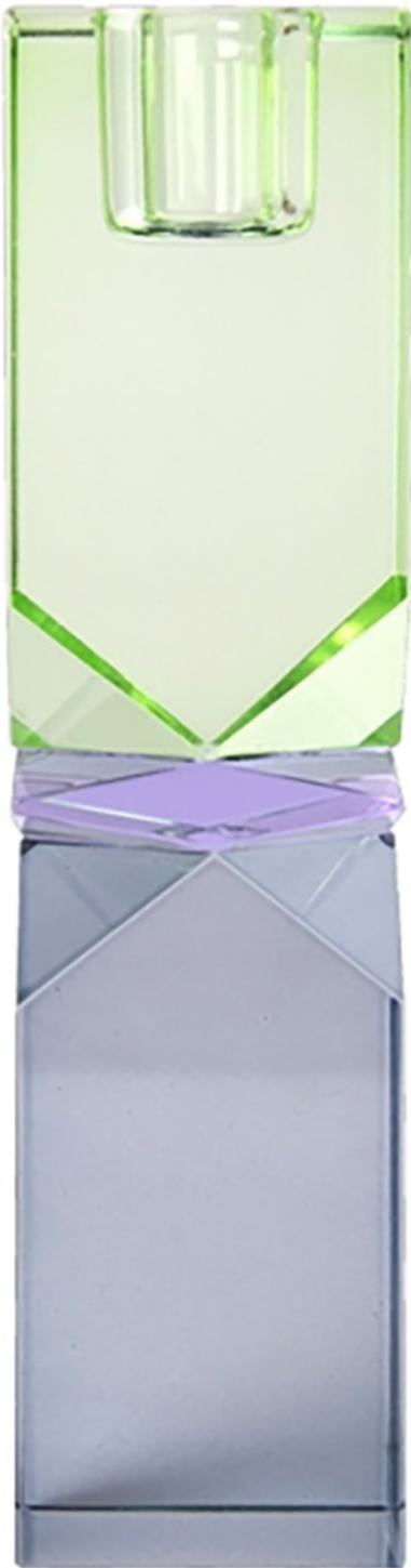
■ O179002XOF / O179002XDD